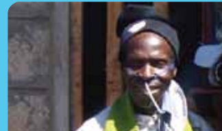
Palliative Care brings Comfort

Over 1.4 million Kenyans are currently living with HIV/AIDS and will need pain and symptom management