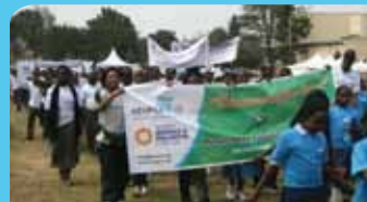
Advocacy and Awareness

There are over 300 AIDS related deaths per day in Kenya, most people die without adequate care and pain control.