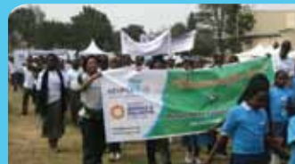
Advocacy and Awareness

There are over 300 AIDS related deaths per day in Kenya, most people die without adequate care and pain control.