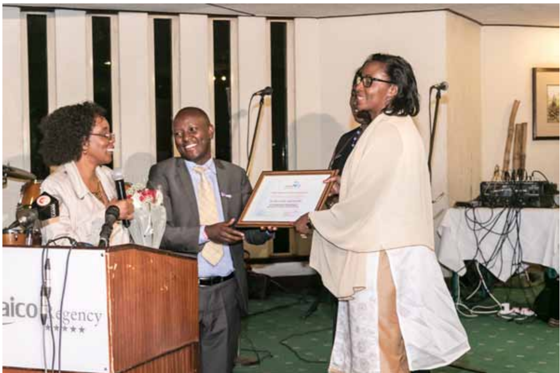
KEHPCA's goodwill ambassador Hon. Beatrice Elachi awarded a certificate of recognition by Dr Joseph Kibachio - Head of Non Communicable Diseases Ministry of Health

Most county governments are yet to prioritize palliative care and allocate resources to support full integration of palliative care services. With reduced donor funding, there is need to mobilize local partners and stakeholders to support scaling up palliative care services. KEHPCA is working closely with the palliative care good will Ambassador Senator Beatrice Elachi to address these gaps. Whenever KEHPCA staff makes visits to various counties, there have been strategic meetings with the county health officials aimed at advocating for support for palliative care. This has born fruits in some counties like; Nyeri, Kilifi, Kiambu, Murang'a, Meru, Kitui, Machakos, Makueni, Embu, Kisii, Laikipia, Nyandarua, Garissa and Nakuru. The need for pediatric palliative care is still great and more work is needed so as to realize the vision of quality palliative care for all in Kenya.