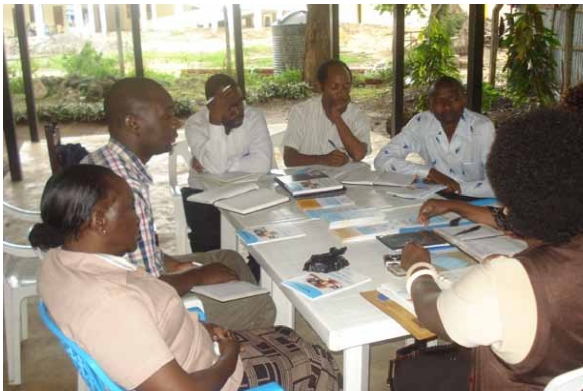
Advocates, trained palliative care providers- in a mentorship forum on legal aspects in palliative care at Coast hospice

Kenya Hospices and Palliative Care Association (KEHPCA) carried out a needs assessment and established a gap in legal services provision by hospices and palliative care units. To address this gap, KEHPCA trained and sensitized health providers, paralegals and advocates. A model of integration of legal support is been implemented successfully in four hospices in Kenya. Some of the legal services provided include; will writing, property dispositions, dispute resolution, power of attorney, child support, access to palliative care for prisoners and other vulnerable groups. The advocates provide pro bono support as part of their contribution to palliative care, while the community paralegals work on voluntary basis.