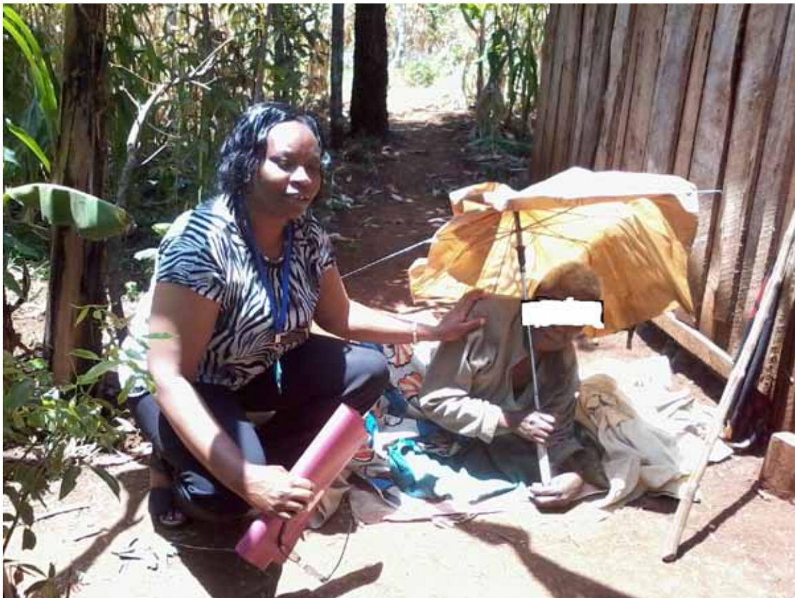
A palliative Care provider serving a patient at home in a rural setting

“Our patients used to travel for long distances to Coast Hospice to get the palliative care support including morphine. The unit has relieved them this burden,” said the hospital administrator at Kilifi County Referral Hospital.