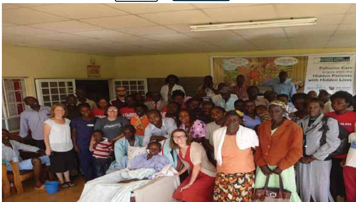
Marking the Palliative Care week at Kimbilio Hospice

There is an increasing population of prisoners in need of palliative care services but have limited access since the health care units within prisons have not been equipped to provide these services. The prison visits are aimed at sensitizing both the prisoners and the administrators on the benefits of having this services and strengthen referral pathways so that prisoners will not live or die in pain.